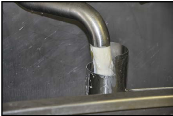
Figure 1. Residual milk rinsed from pipelines.

Ideally, pre-rinse all surfaces immediately after milking with lukewarm (100 to 110° F) water to remove milk solids. Lukewarm water should be used when adequate hot water supply allows for both a warm water pre-rinse and hot water wash. The initial rinse water contains residual milk (Figure 1). When done properly, this rinse removes more than 70% of the soil load. Do not re-circulate this water through the milking system. Discharge the rinse water and continue the rinse cycle until the water appears clear (Figure 2).