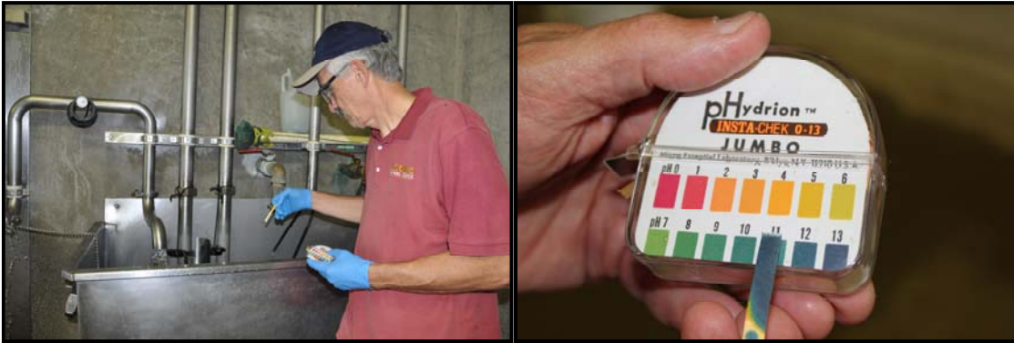
Figure 3. Check that the pH of the detergent solution is between 11 and 13. Remember to use safety equipment (gloves and goggles) to protect from splashing.

Why an alkaline detergent? Milk fat and water do not mix. The (basic) pH of the detergent breaks up any remaining milk fat into tiny droplets, suspending the fat in the detergent wash water. Use your pH paper to check that the pH is between 11 and 13 (Figure 3).