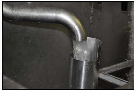
Figure 2. Clear water rinsed from pipelines.

With your thermometer, monitor the temperature of the rinse cycle at the return line: