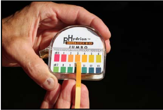
Figure 6. Check that the pH of the acid rinse is between 3 and 4.

surfaces. When minerals collect with organic material on equipment surfaces, milkstone (a white, chalky film) develops. Milkstone provides areas on contact surfaces for bacterial growth within the milking system. The acid rinse reduces the pH of the equipment, which helps to prevent bacterial growth between milkings. The acid rinse also neutralizes the chlorine and alkaline residues from the wash cycle and helps to prolong the life of any rubber parts.