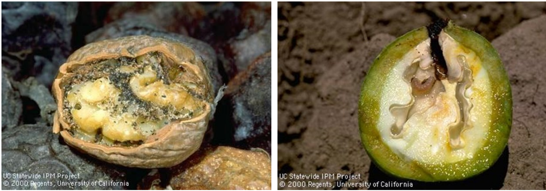
Fig. 3. Walnut damaged by: a) navel orangeworm, b) codling moth