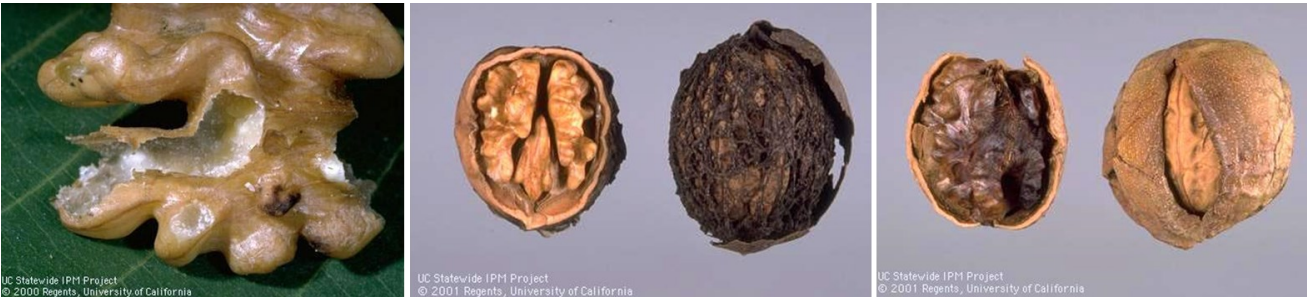
Fig. 4. Walnut damaged by: a) ants; b) walnut husk fly; c) sunburn