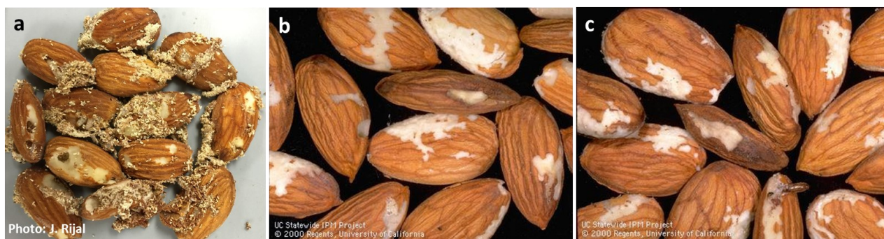
Fig. 1. Almond kernels (nutmeat) damaged by: a) navel orangeworm, b) peach twig borer, c) Oriental fruit moth

2.4. Sunburn Damage. Sunburn damage on nuts can be confused with husk fly damage. In the case of sunburn, nutmeat is shriveled and darkened on one side of the nut — no evidence of frass, webbings, or larval presence (Fig. 4c). Husks from sunburn damaged nuts can be removed from the shell during processing, which is not the case for the nuts damaged by husk fly.