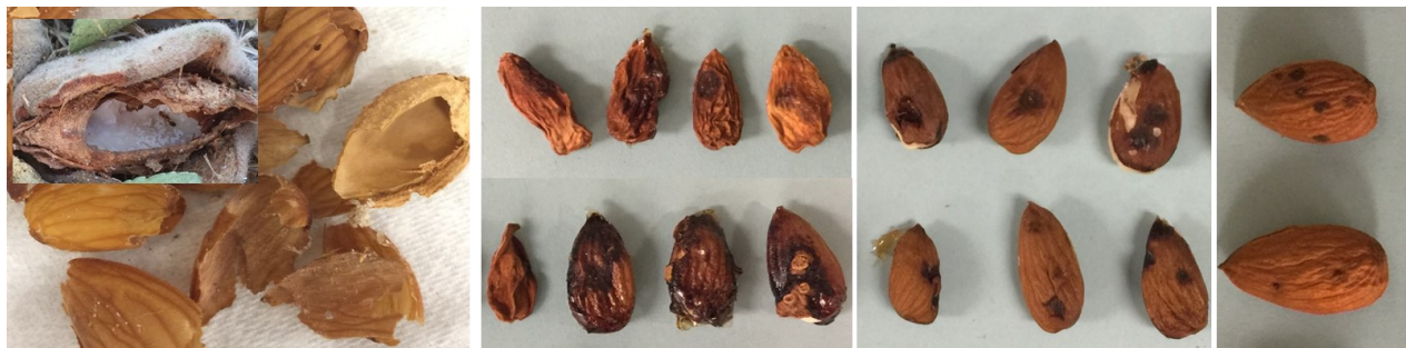
Fig. 2. Almond kernels damaged by: a) ants, b-d) leaffooted bug and brown marmorated stink bug