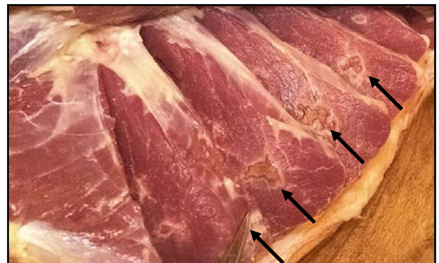
Figure 1. Arrows point to injection site lesions that span cuts of beef.