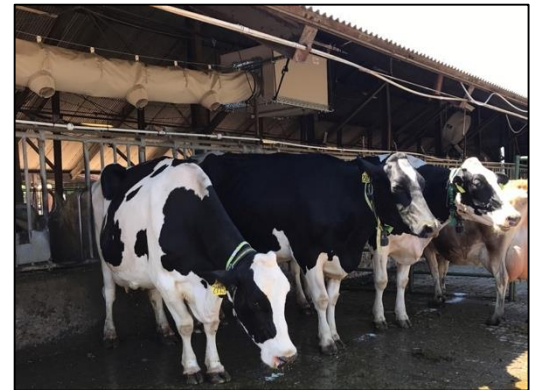
Cows line up to receive cooling from innovative direct evaporative coolers at the UC Davis dairy.

Two new and innovative methods of cooling are currently being evaluated at the University of California, Davis. These technologies are designed to reduce water use by up to 86% and energy use by up to 38%, which could potentially result in sizeable economic and resource savings for the dairy industry. The two technologies were tested in comparison to the traditional soaker and fan combination at the university dairy this summer. The researchers are now in the process of analyzing data to determine which technology was the most effective and efficient when cooling the cows. One of these technologies will be tested on a commercial scale in the Central Valley, next summer. Water and energy use, as well as production, will be quantified in this test to evaluate cost effectiveness.